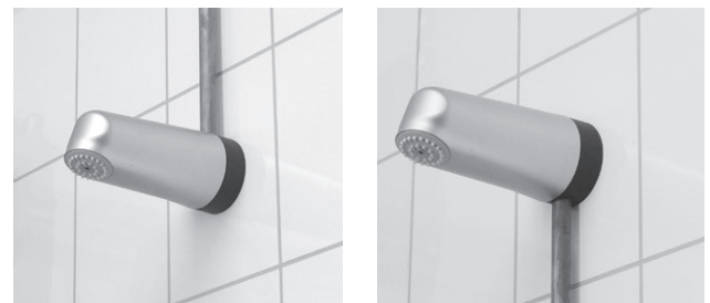
The Flex shower offers a flexible installation as water connection can be made from the behind, from the top, from the side or the bottom.